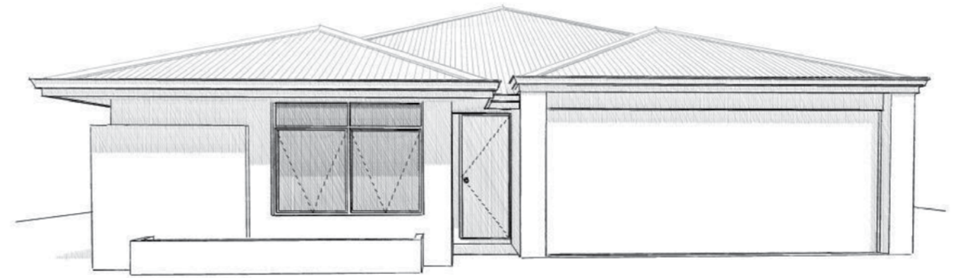
Brighton Beach Included