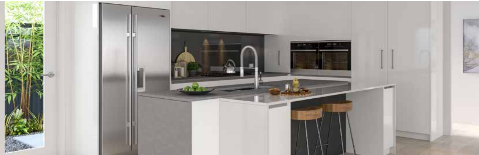
LUXURY KITCHEN - CORNER