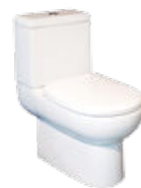
China Toilet Suite with Soft Close Seat