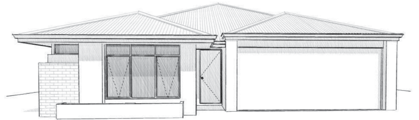
Brighton Beach Premium