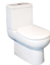
China Toilet Suite with Soft Close Seat