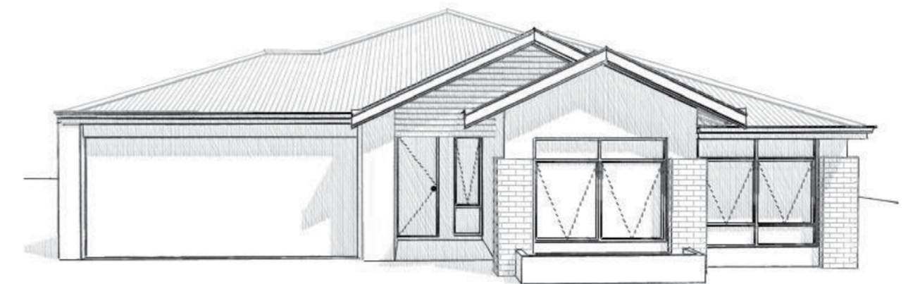
Bronte Beach Premium