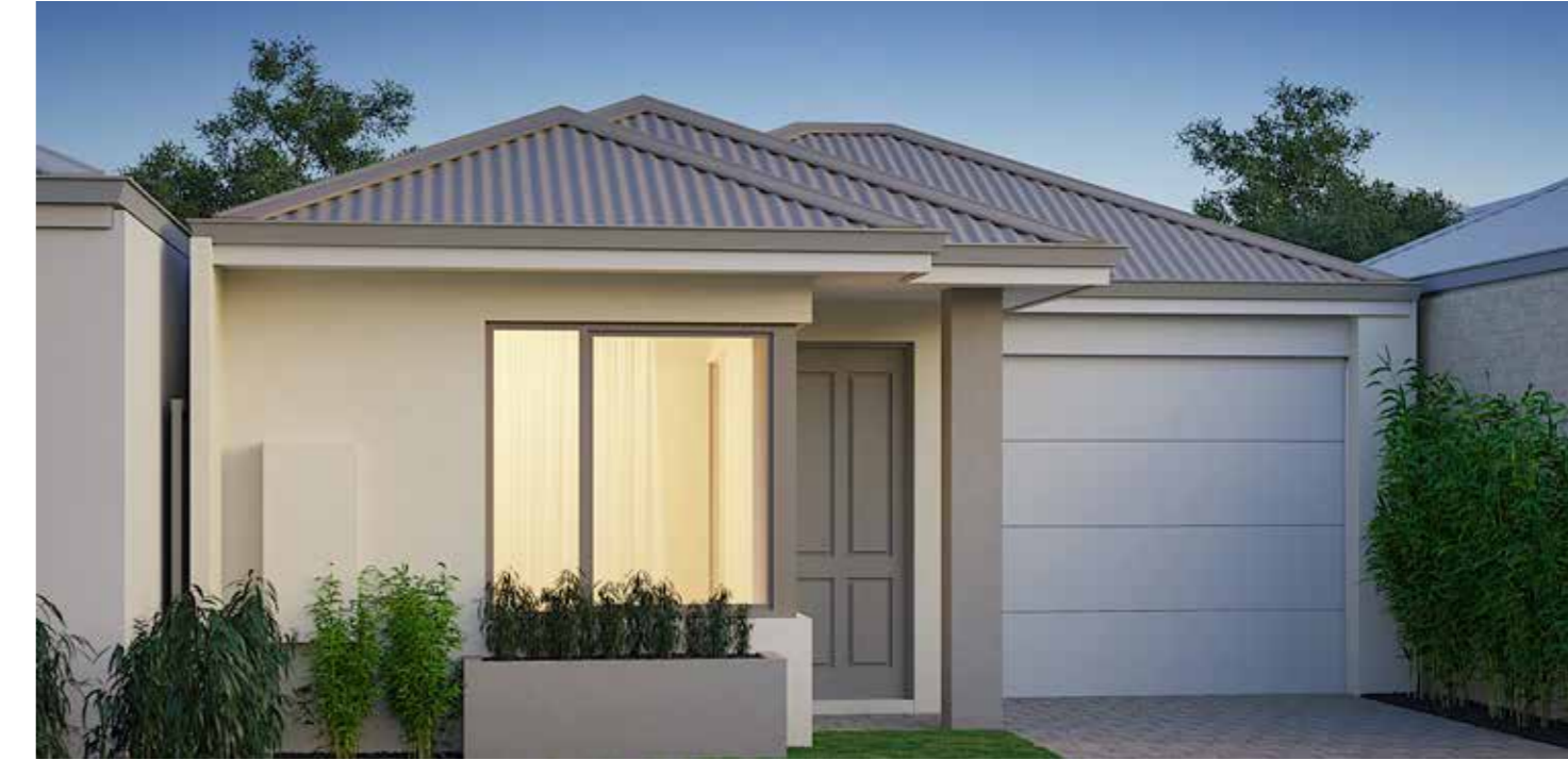
The Trigg Included

VITAL STATS | Living area 101m 2 (including Alfresco) | Total area 123m 2 (excluding eaves) | Scale 1:100