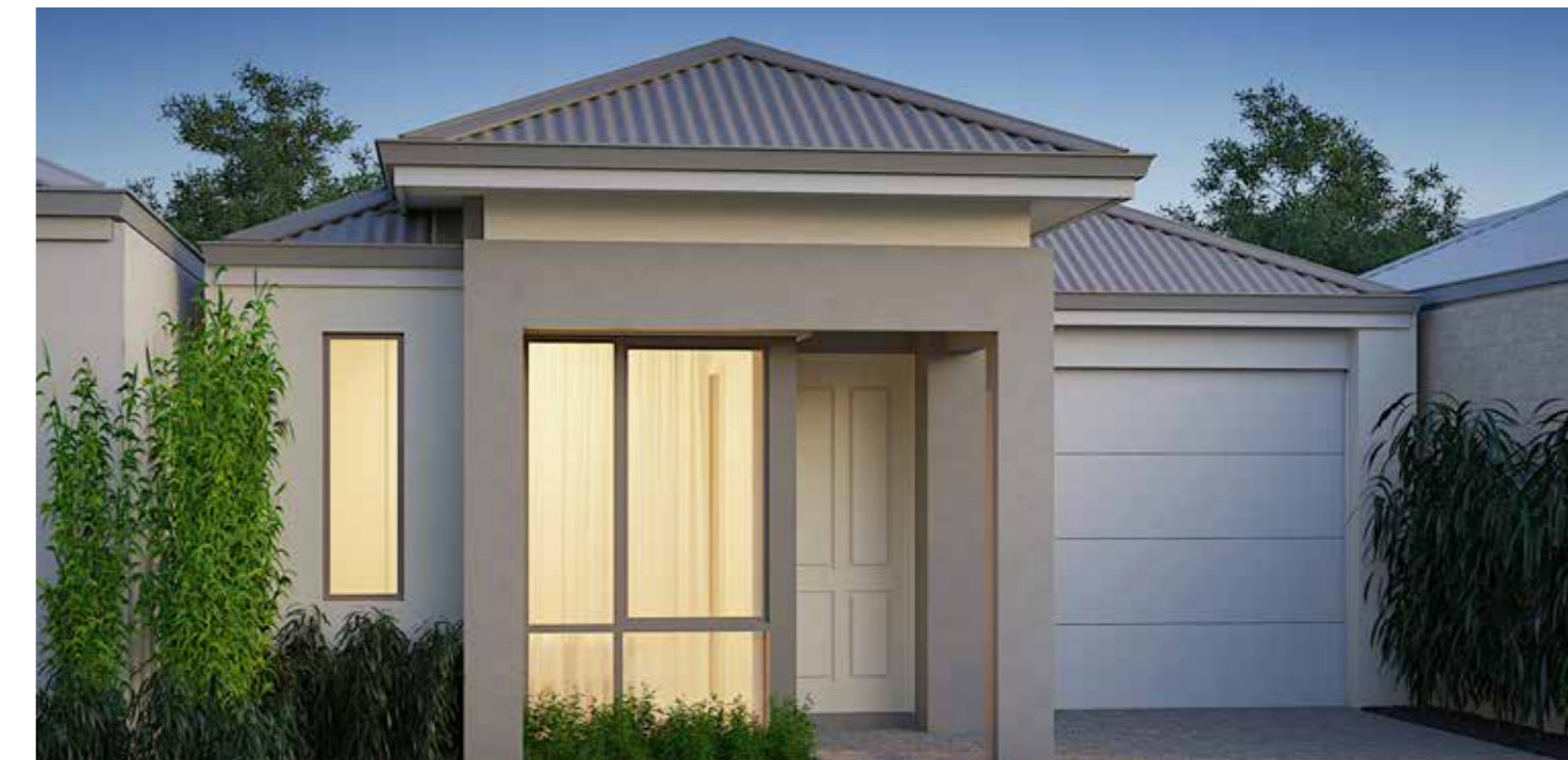
The Trigg Premium