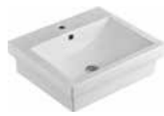
Above Mount China Vanity Basin