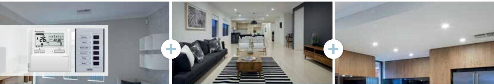
REVERSE CYCLE AIR CON