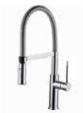
Kitchen Sink Mixer