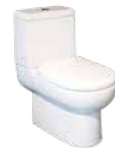
China Toilet Suite with Soft Close Seat